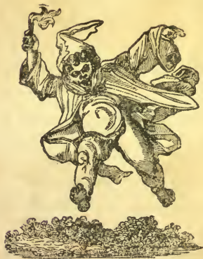
Alter et Idem.